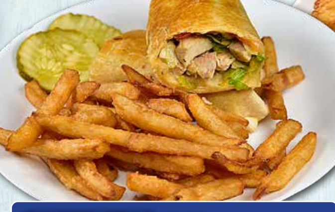
CHICKEN WRAP - 10.95

BBQ BACON BURGER - 11.95 Cheese, bbq sauce & onion rings